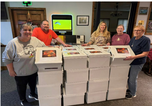
VFW Auxiliary 7155 in Trappe was busy making Thanksgiving dinners for the Veterans in their community.