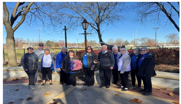
Members of Auxiliary 5956 in Manheim helped with a wreath laying ceremony at Manheim Veterans Memorial Park.